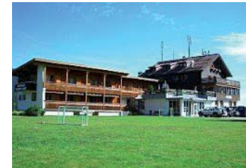
Mountain guesthouse „Waldemar Petersen Haus“ of TU Darmstadt in Hirschegg