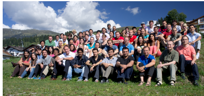
Participants of the ISU energy 2013

www.helmholtz-berlin.de/events/isu-energy