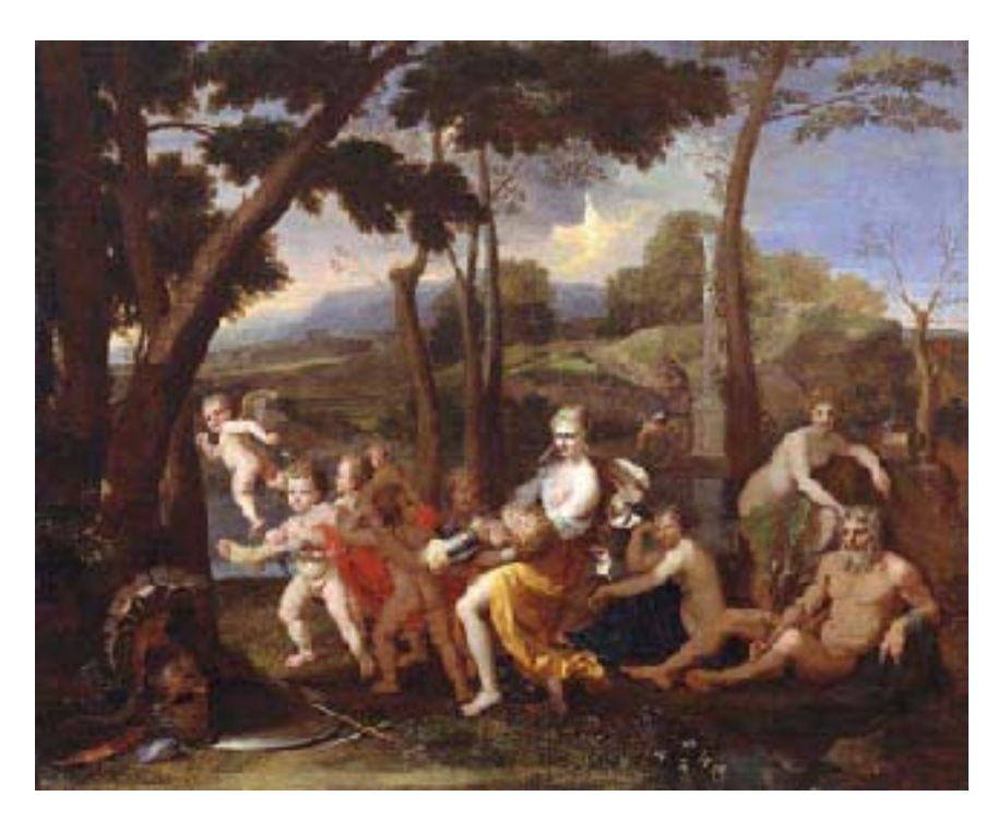
Fig. 1: Nicolas Poussin, Replica, "Armida abducts the sleeping Rinaldo", (c. 1637), Picture Gallery Berlin, 120 x 150 cm2, Cat No. 486

Neutron autoradiography is capable of revealing different paint layers piled-up during the creation of the painting, whereas different pigments can be represented on separate films due to a contrast variation created by the differences in the half-life times of the isotopes. Thus, in many cases the individual brushstroke applied by the artist is made visible, as well as changes made during the painting process, so-called pentimentis. When investigating paintings that have been reliably authenticated, it is possible to identify the particular style of an artist. By an example - a painting from the French painter Nicolas Poussin (1594–1665), belonging to the Berlin Picture Gallery - the efficiency of neutron autoradiography is demonstrated as a non-destructive method.