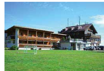
Mountain guesthouse „Darmstädter Haus“ of TU Darmstadt in Hirschegg