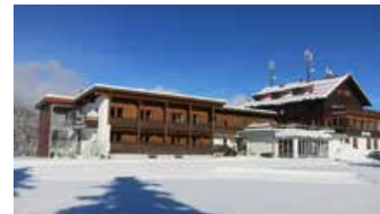
Mountain guesthouse „Darmstädter Haus“ of TU Darmstadt in Hirschegg